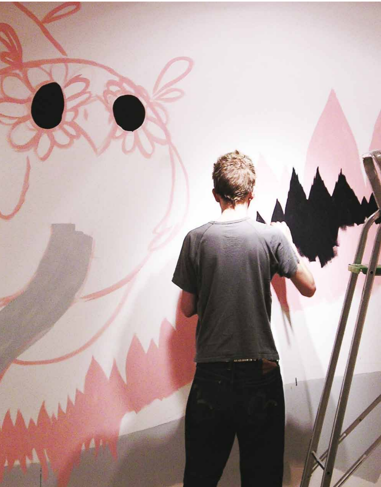
Mysterious AI at the greenhouse .