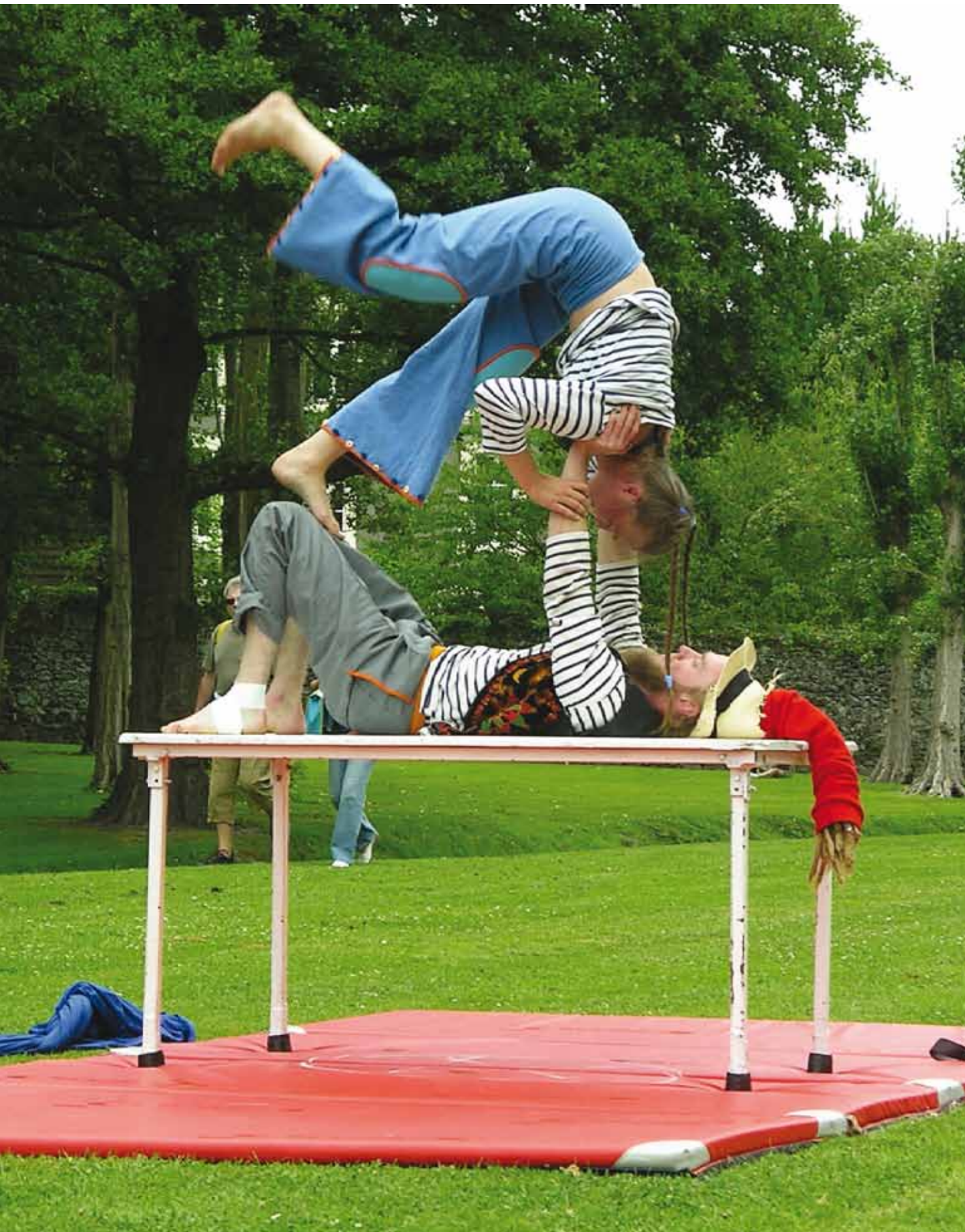
Street Artists at Sorties de Bain.