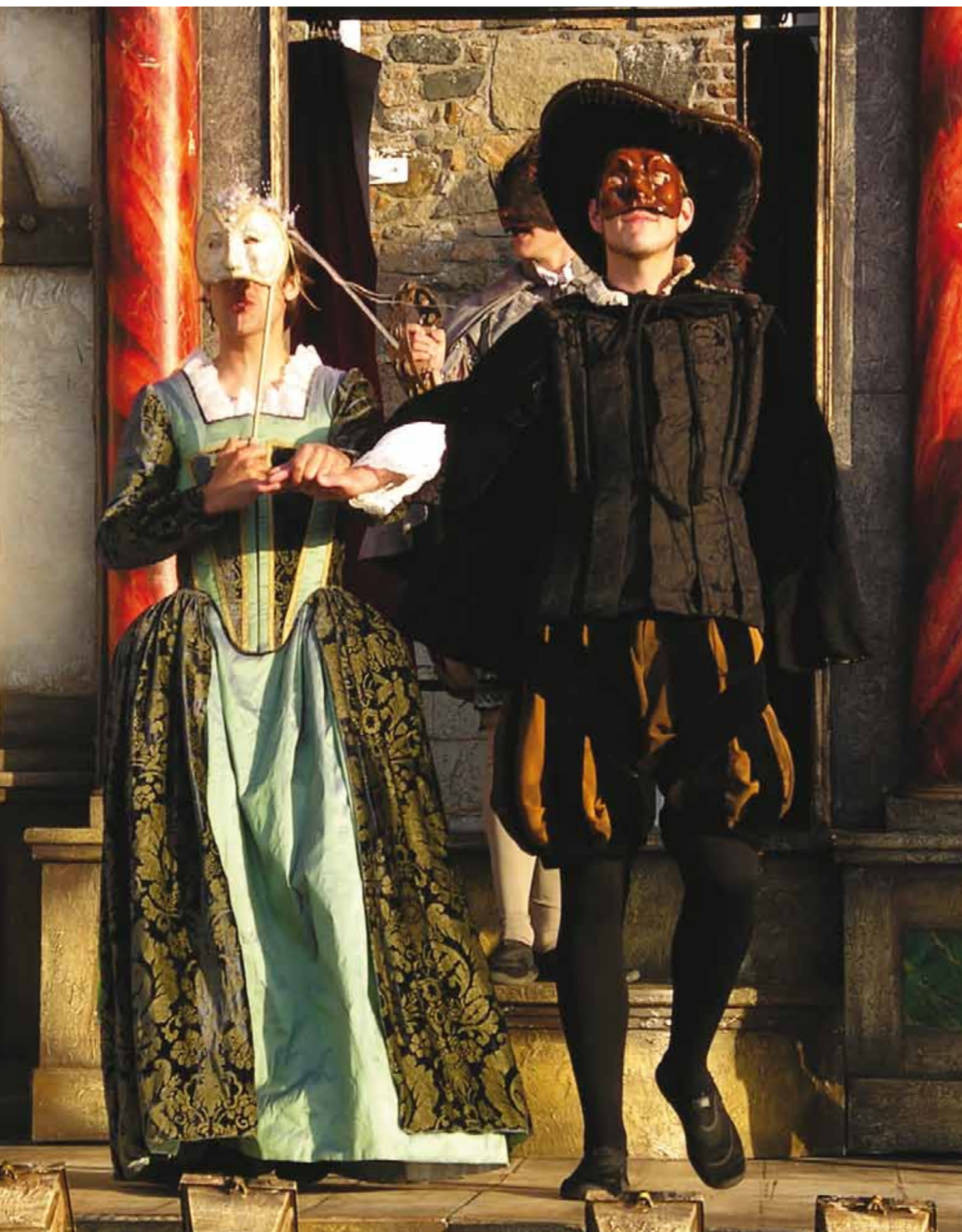
The Lord Chamberlain's Men production of Much Ado about Nothing .