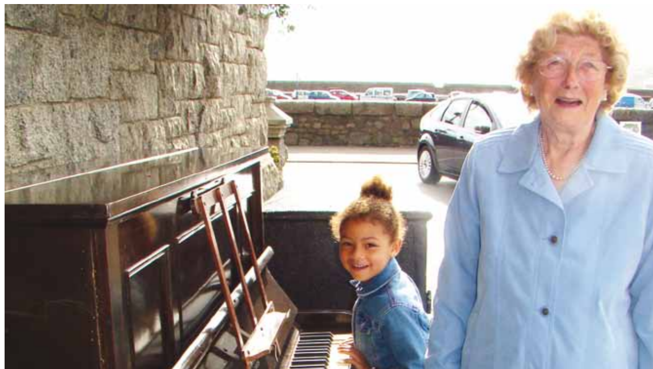
Let's Play, pianos in St Peter Port.

In order to fulfil this aim to help the arts in Guernsey to grow and develop, to involve more people in the arts, and to expand horizons, it was decided to identify certain key objectives for 2009-2011. This would enable focus, while giving a clearly defined list of priorities to the numerous arts practitioners and organisations that apply for support and funding.